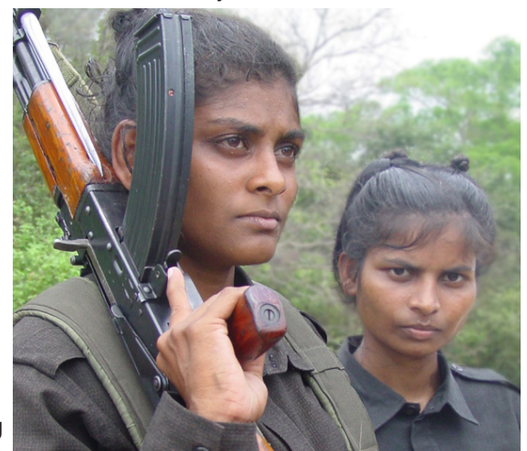
Photo from My Daughter the Terrorist . Courtesy of Women Make Movies, www.wmm.com .

To See If I’m Smiling (Lir’ot Im Ani Mehayechet). Israel is the only country in the world where eighteen-year-old girls are drafted for compulsory military service. In this award-winning documentary, the frank testimonials