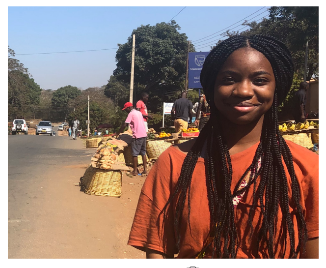
Layla outside a market in Malawi.

"I enrolled in the Environment and NGOS: Internships in Malawi Education Abroad program because I believe there is true value in experiencing the world as it is. My goal during the program was to develop an improved world-view for myself. My wish for my future research stemming from my trip abroad