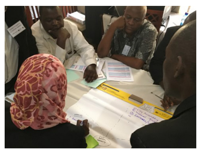
Workshop participants during the systems mapping portion of day one.

To meet these goals, day one of the workshop facilitated trust among the participants. They were asked to think in groups about how the markets work from their perspective and then to create a systems map of the results. Days two and three were focused on conducting a SOAR (Strengths, Opportunities, Aspirations, Results) analysis.